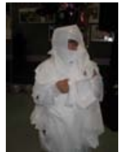
Blair after participating in the mummy wrap game!