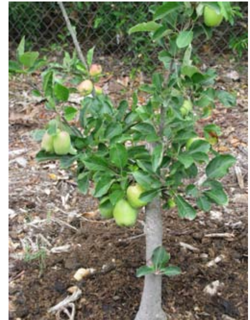
Apple Tree in Alpha Garden