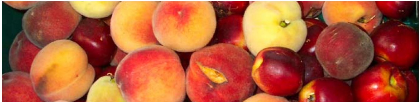
First Harvest from Alpha Garden

in your life, there is an additional one time cost of $150 to have the plaque inscribed and mounted.